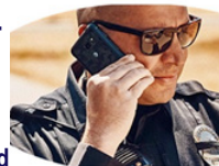
On the Streets