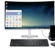
At the Station