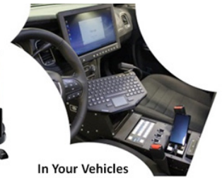
In Your Vehicles